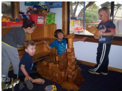
Everyone involved in building

Our children's learning grows through connecting with people, place and the physical environment